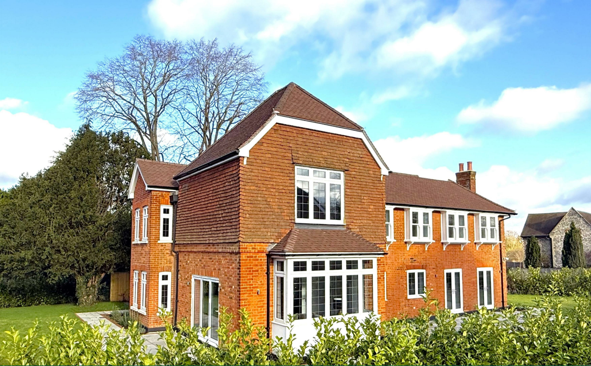
Tretower, Merrow Street, Guildford, Surrey